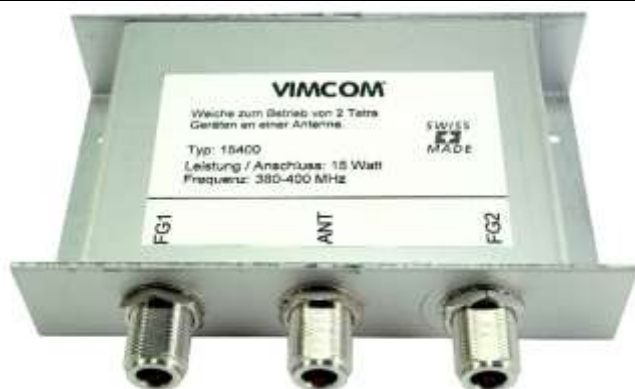
FG1 Ant. (Durchgang)