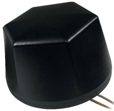
450/1 Planar black